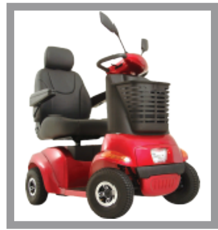
Candy Apple Red