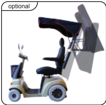
AMS089-Convertible hood cover