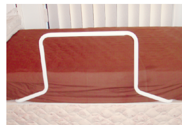
Can be used as a bed rail support