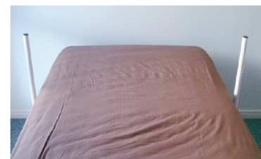
Can be used as a dual support pole, assists the patient into a seated position