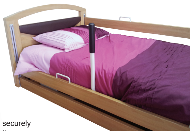
Can be used as a support pole, assists the patient into a seated position