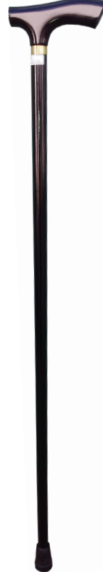
EWS275-C - t-shaft handle