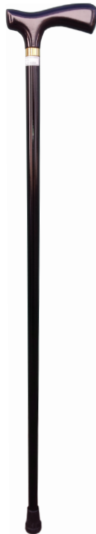
EWS275-B - t-curve handle