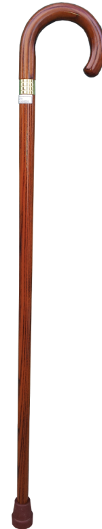
EWS275-D - hook handle