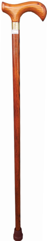
EWS275-A - t-hook handle