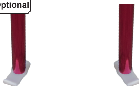
TSA230-G Rear ski tips