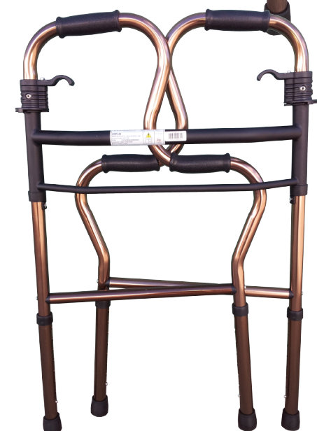
Folds compact for storage and transportation