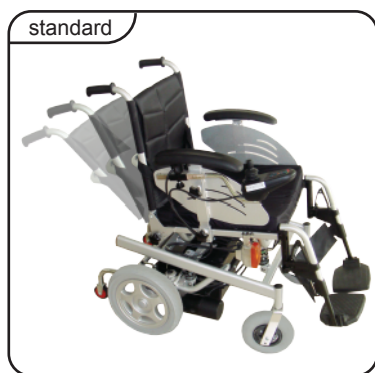
standard Reclining backrest Adjustable angle 90deg - 120deg